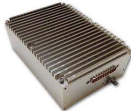
Fig. 1: C-Band STALO Unit

Spurious signal levels less than -60 dBc at a 1MHz frequency step are guaranteed through 100 % automated spur test. All performance parameters are achieved over an operational temperature