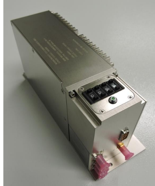
Figure 1- X-Band Source

Nanowave Technologies HMIC subassemblies are used throughout the design to ensure high reliability and compliance to environmental specification.